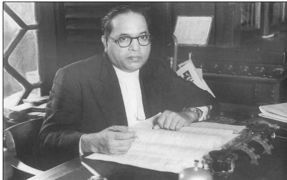
Dr. Bhimrao Ramji Ambedkar