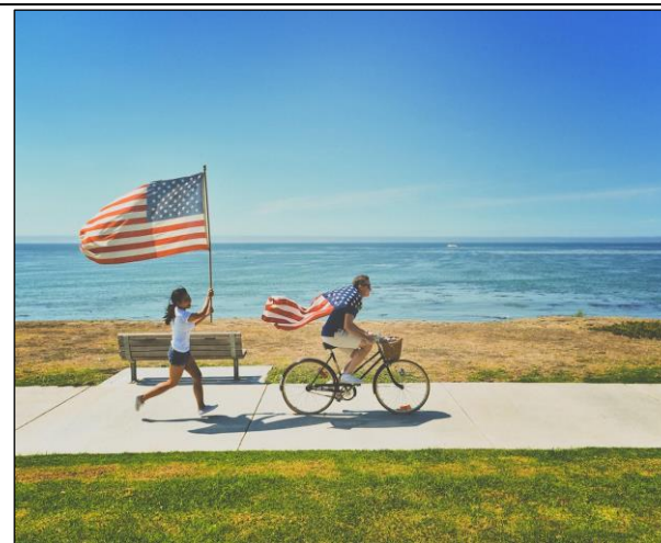
Even the American Society has its own share of injustices