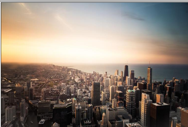
Developed nations are often perceived to be more progressive