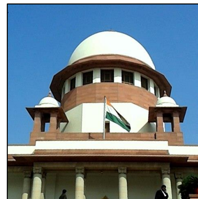
The Judiciary