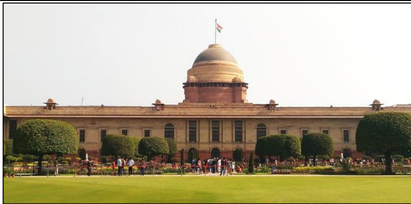
The Executive